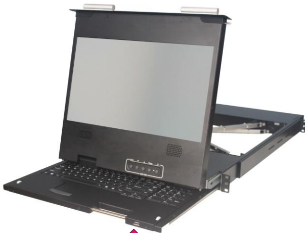
(USB Port for device access)

Optimize rack space. Maximize rack monitoring DVI-D-USB & VGA-USB, Audio, Hub