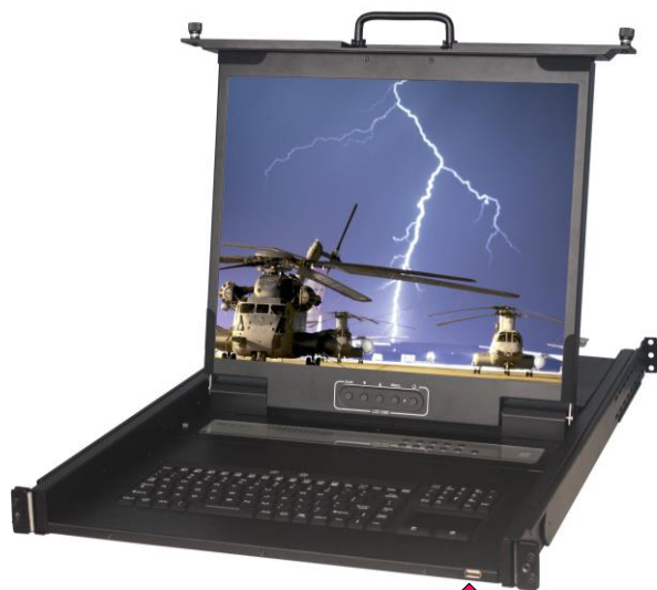
USB port for Keyboard/Mouse

Optimize rack space. Maximize rack monitoring