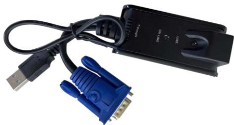
CAT6 KVM Dongle-USB&VGA (DGU)

Optimize rack space. Maximize rack monitoring