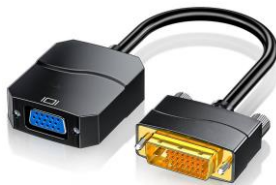
DVI 24+1 changer