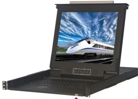
(USB Port for device access)

Optimize rack space. Maximize rack monitoring