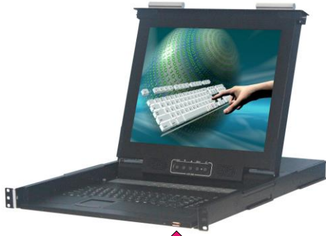
(USB Port for device access)

Optimize rack space. Maximize rack monitoring