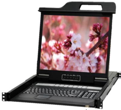
↑ (USB Port for device access)

Optimize rack space. Maximize rack monitoring