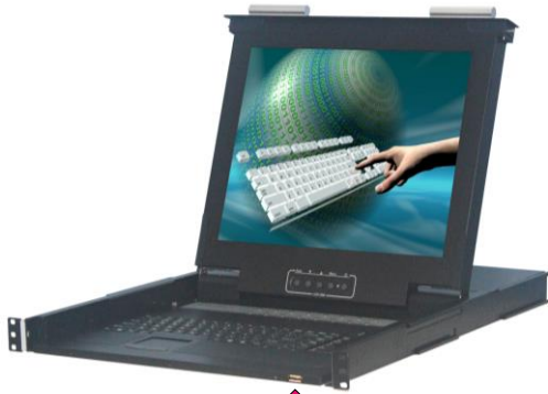
↑ (USB Port for device access)

Optimize rack space. Maximize rack monitoring